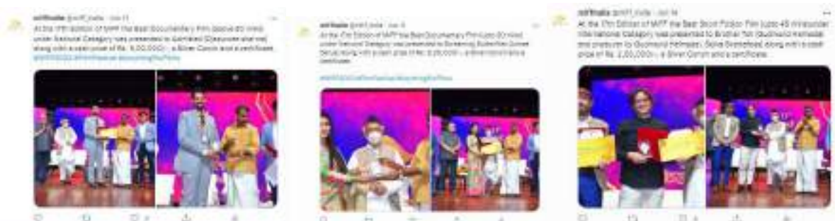
MIFF – 2022 Closing and Award Ceremony