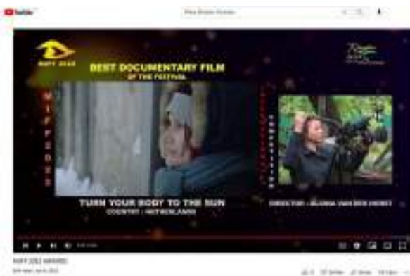
MIFF 2022 - Awards