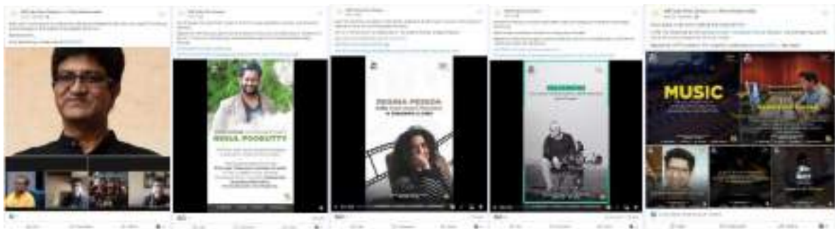
Master Classes & Workshops