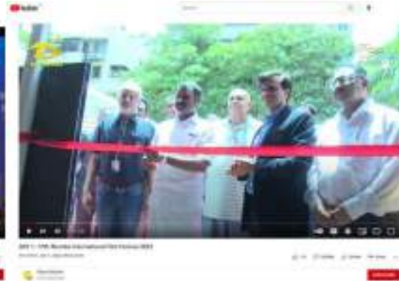
Day - 1