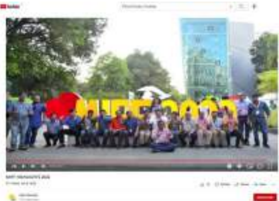
MIFF - 2022 Highlights