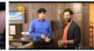
Day - 5