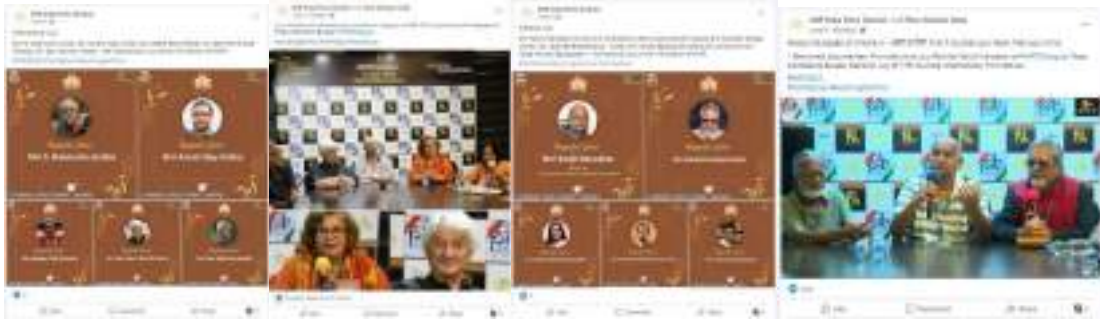
International Jury Members