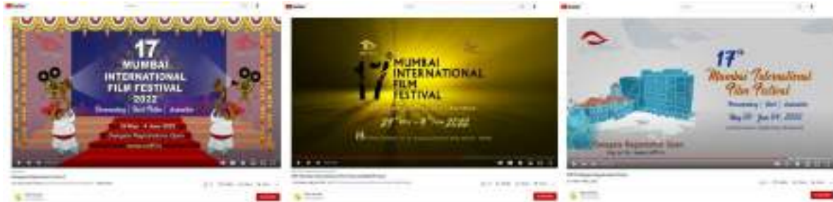
MIFF - PROMOS

https://www.youtube.com/watch?v=j5k719bW314&list=PLZN9KGi5w_41Ajueo_FzDsPE7uKEEsQ8d