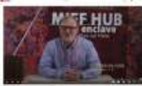
Day - 2