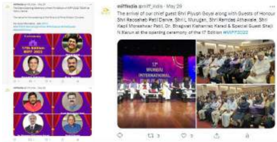
MIFF – 2022 Opening Ceremony