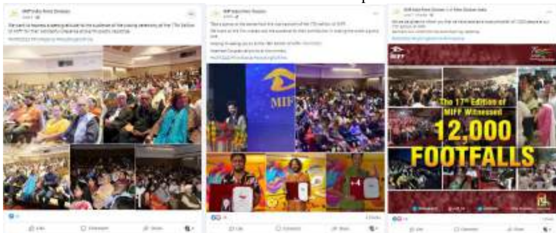
MIFF – 2022 Closing and Award Ceremony