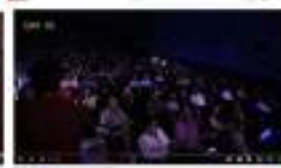
Day - 3