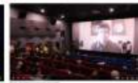
Day - 4